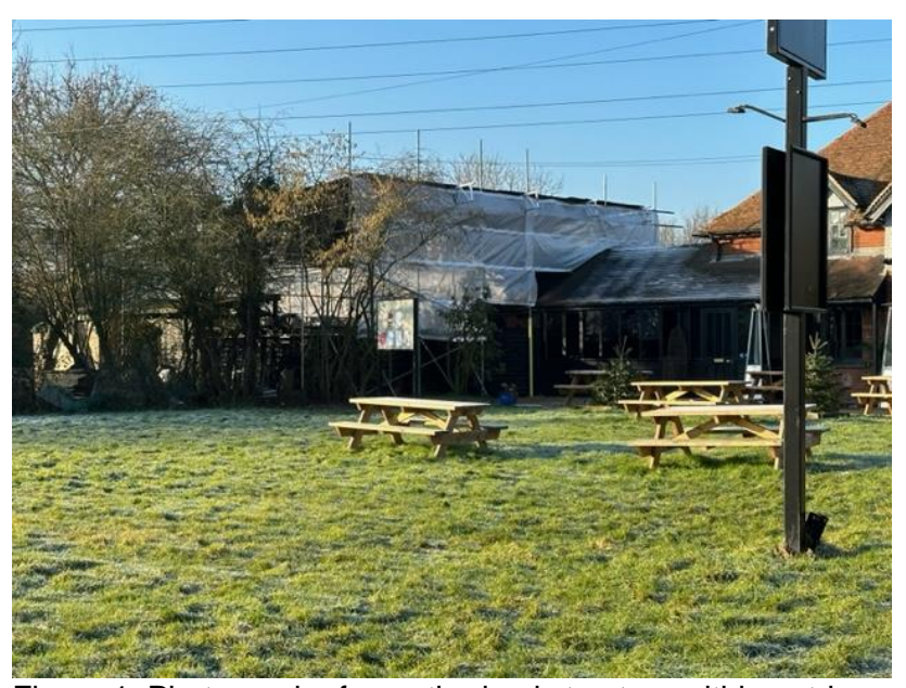
Figure 1: Photograph of unauthorised structure within outdoor seat area of Tranquil Turtle.

4.1.11 It was reported to the Council that an unauthorised structure had been erected at Tranquil Turtle which covers the outdoor seating area of the premises (See Figure 1).